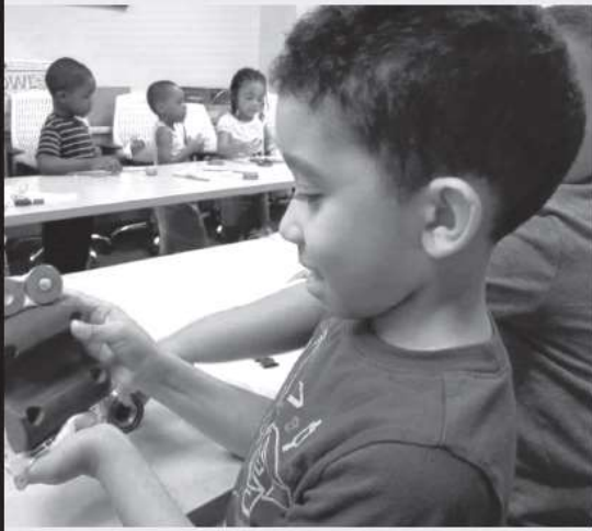
Children taking part in Summer Start building critical 21st Century skills.