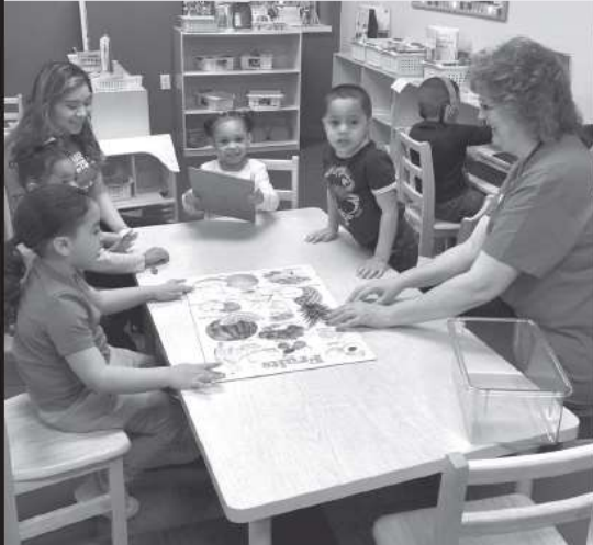
Air Products volunteers spend time in the Learning Hub-City Center