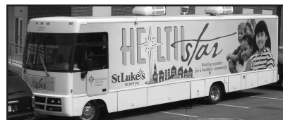
St. Luke's Hospital and Health Network brings its dental van to CSC's Donley Campus several times a year so that children may receive check ups. Dental care is one component of an enormous health, safety, and nutrition service that CSC provides low-income children and families.

As a parent of a child in SafeStart, I want you thank you for all your time and your kindness.